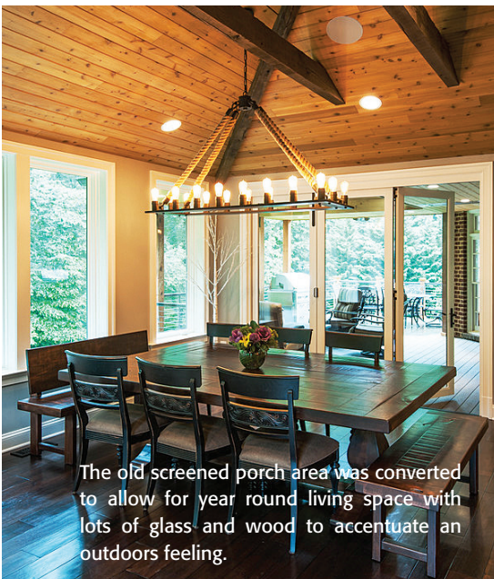
The old screened porch area was converted to allow for year round living space with lots of glass and wood to accentuate an outdoors feeling.