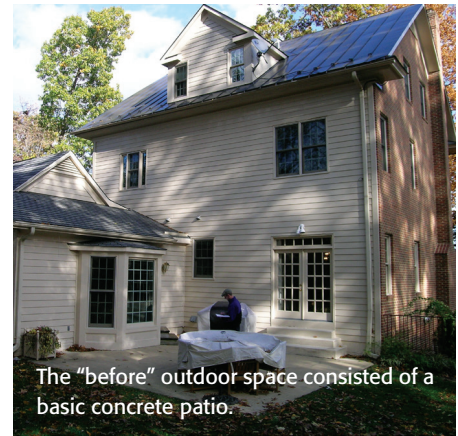
The "before" outdoor space consisted of a basic concrete patio.

AUTHOR: Wilma Bowers is the co-owner of Bowers Design Build located in McLean, VA.