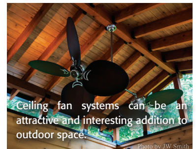
Ceiling fan systems can be an attractive and interesting addition to outdoor space.