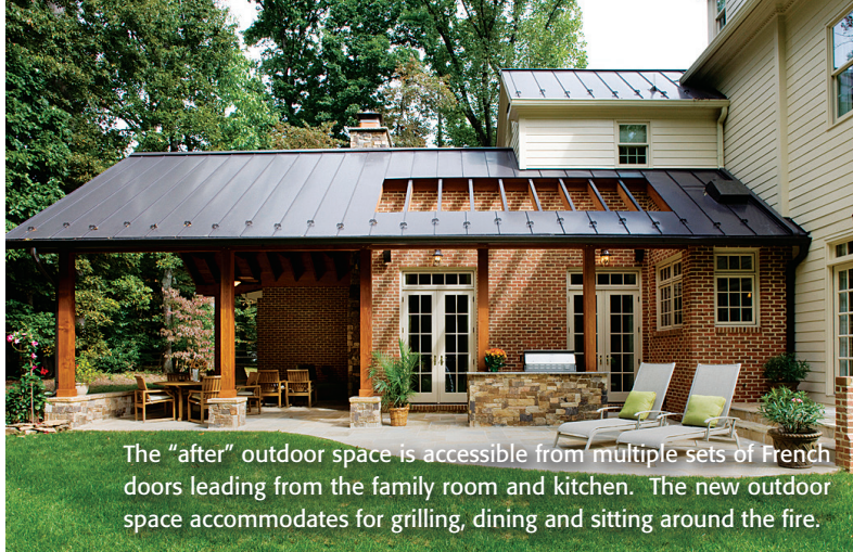
The "after" outdoor space is accessible from multiple sets of French doors leading from the family room and kitchen. The new outdoor space accommodates for grilling, dining and sitting around the fire.