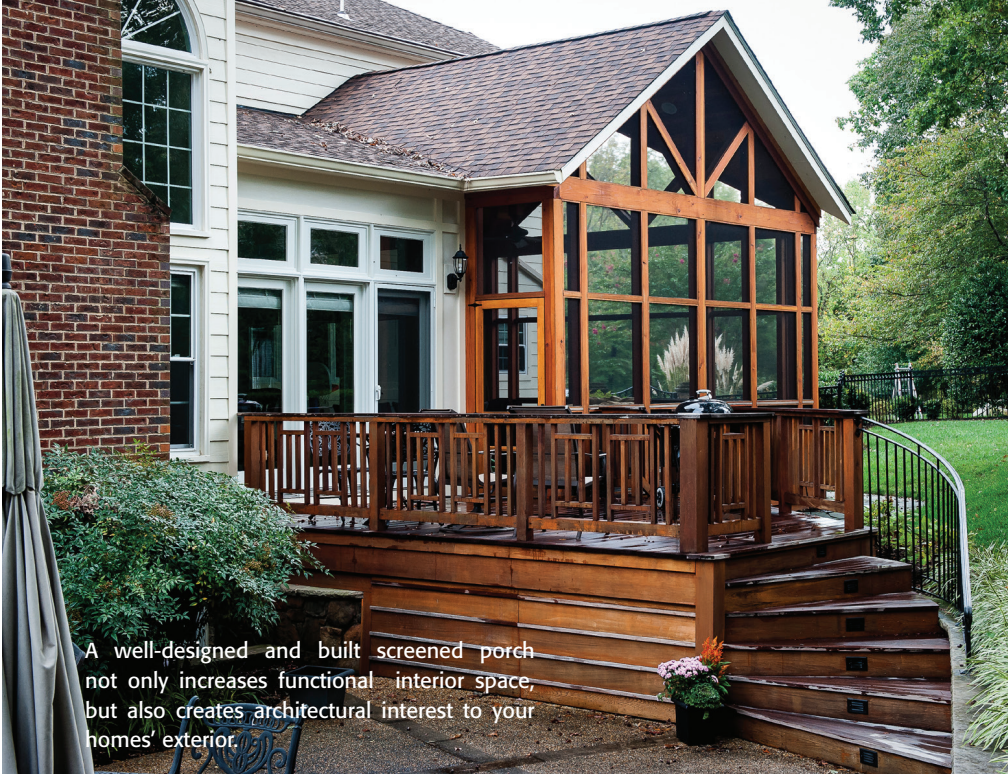
A well-designed and built screened porch not only increases functional interior space, but also creates architectural interest to your homes' exterior.