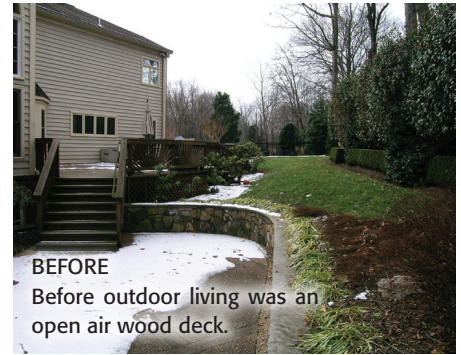
BEFORE Before outdoor living was an open air wood deck.