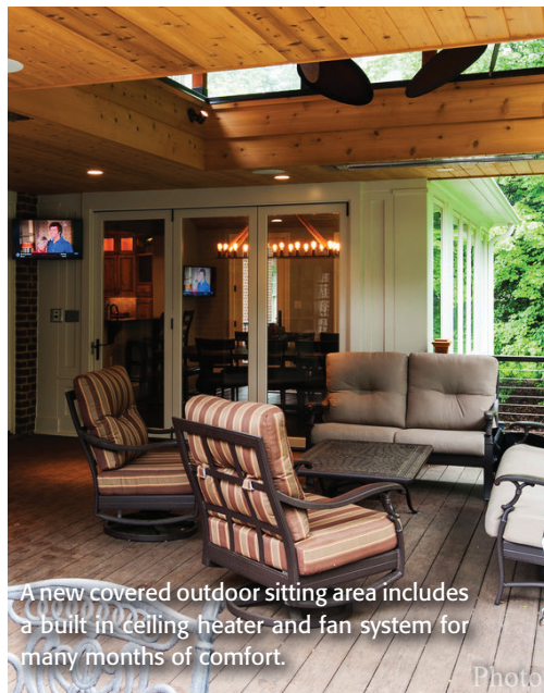
A new covered outdoor sitting area includes a built in ceiling heater and fan system for many months of comfort.